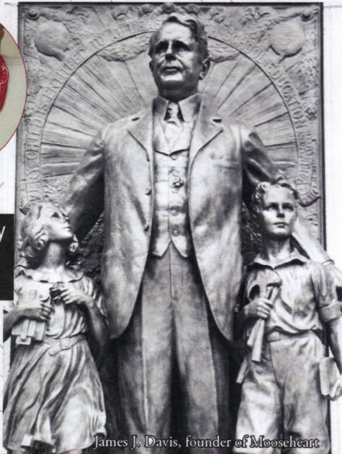
James J. Davis, founder of Mooseheart

Please wear your Donors Circle pin proudly and share the story of Mooseheart & Moosehaven at every opportunity.