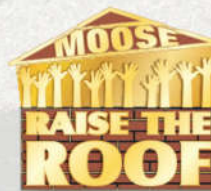
Lodge & Chapter Pin

"Moose – Raise the Roof" lapel pins are presented by your Lodge, Chapter or Moose Legion to members that sponsor their first member during this campaign.